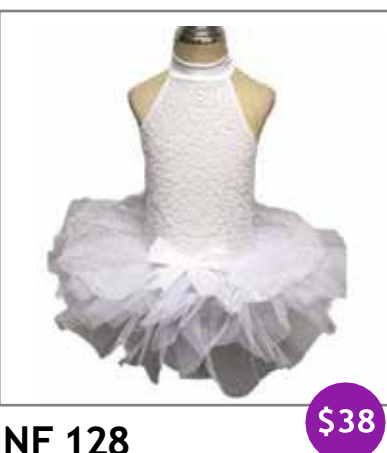
NF 128 Color: White