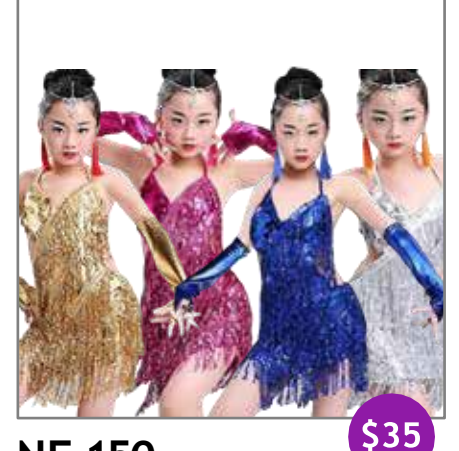
NE 150 Colors: Silver, Blue, Hot pink