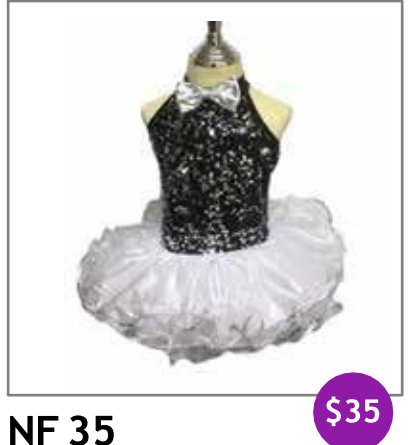
NF 35 Colors: Silver