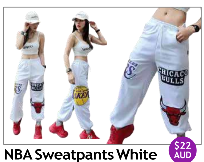
Waist: Stretch from 24 to 38 inches Length: 40 inches