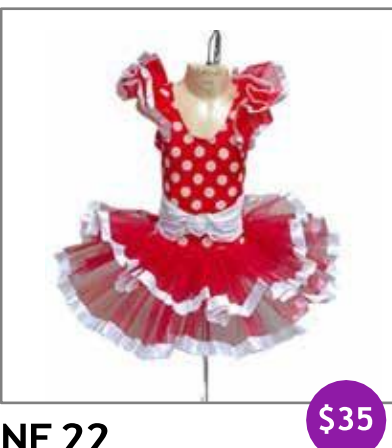
NF 22 Colors: Pink, Blue, Red