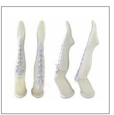
Foot Spats White Colors: Red, White, Black, Pink, Blue, Green, Orange, Yellow, Aqua