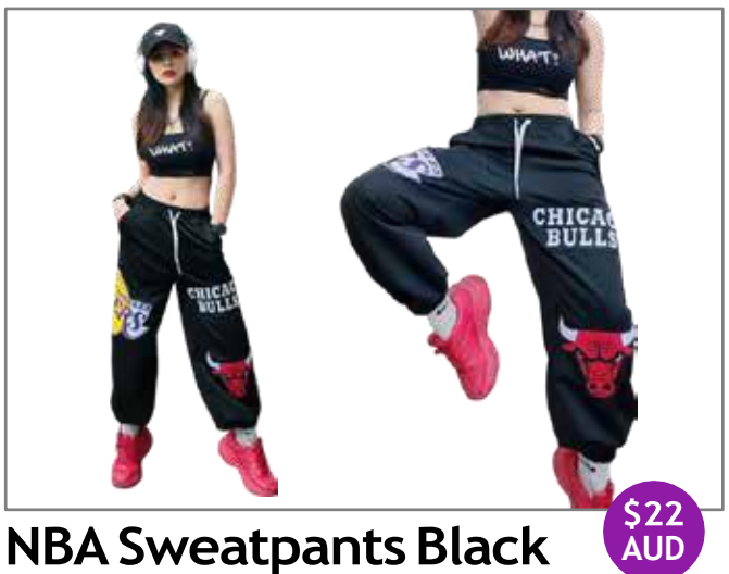
Waist: Stretch from 24 to 38 inches Length: 40 inches