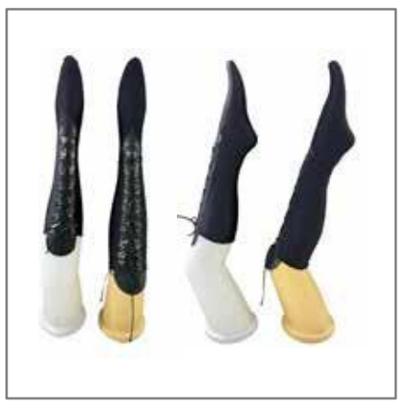
Foot Spats Ch: $22 - AD: $24