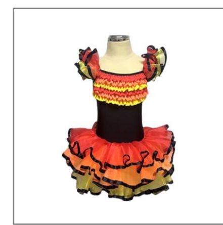
NF02B From $35 AUD