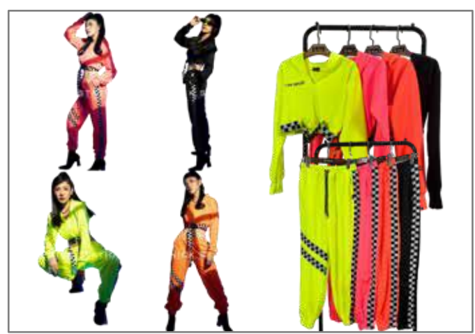
Race Hooded Cropped Top $18 Add Sweatpants $22 AUD