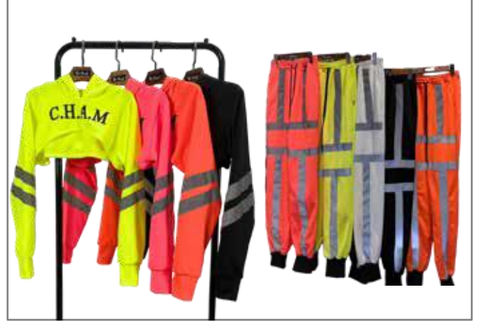
CHAM Hooded Crop Top $18 Add Pants $22