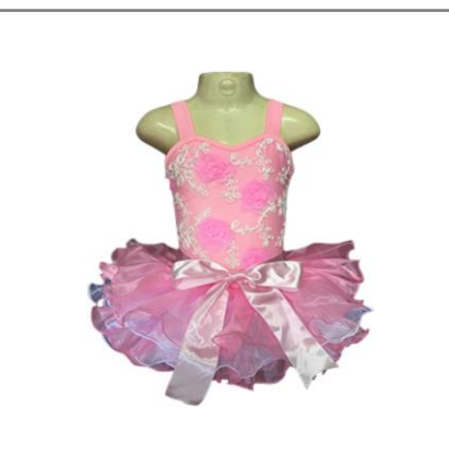
NF 102 pink $35 ss-cm - $37 cl-cxxl