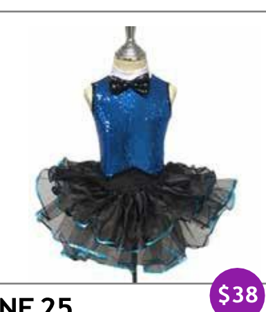
NF 25 Colors: Golden, Silver, Blue, Red