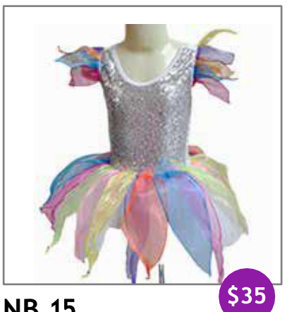
NB 15 Silver