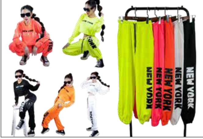
NY Top $18 AUD Pants $22 AUD (Buy separately or as a set)

Unisex. Chest: 48-50 inches - Length 29 inches