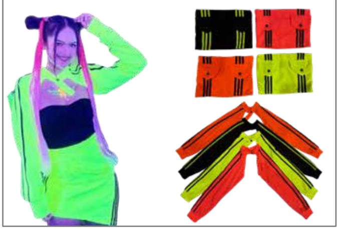
Fluro Crop Tops $16 Shoulder Shrug $16 (Buy separately or as a set)

Unisex. Chest: 48-50 inches - Length 29 inches